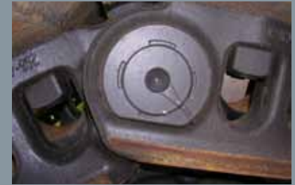
PPR2 Track resists link end play, increasing seal life and maximizing track life.

When your track does need repair, we have the trained professionals, proper equipment, and excellent parts availability to get your machine back running quickly and reliably.