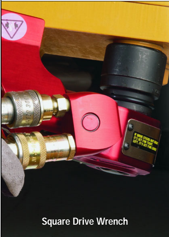
Square Drive Wrench