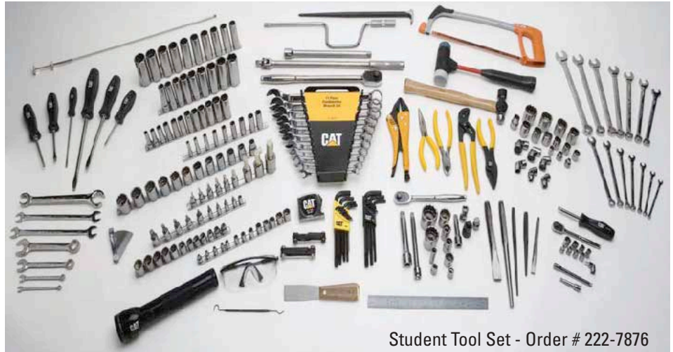
Student Tool Set - Order # 222-7876