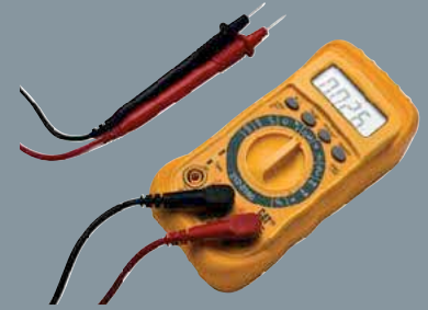
212-2160 Multimeter pocket size