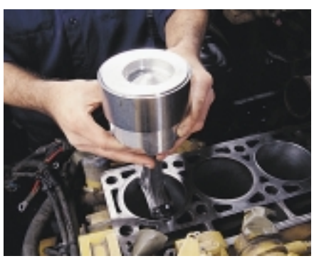
Use the installation tool to install the Reman Piston Pack quickly and easily.