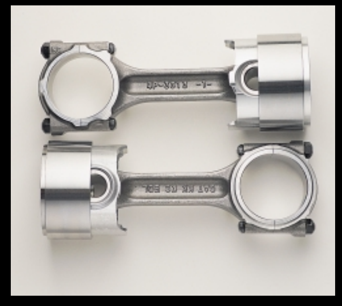
Reman Piston Packs feature an assembled connecting rod, piston, and piston rings. Rings are compressed inside an installation tool.