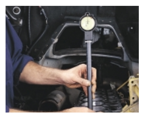
Inspect the parent bore.