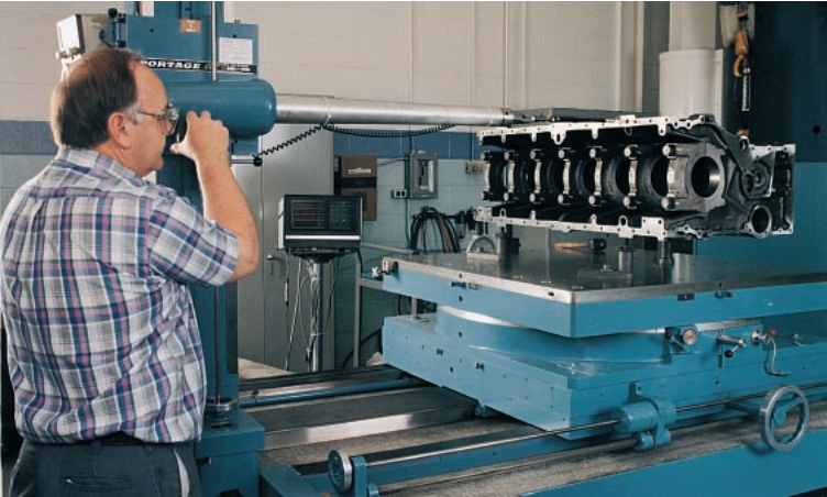
Cat Reman Short and Long Blocks are tested to meet same-as-new performance standards.

Cat Reman Short and Long Blocks are factory remanufactured using only Caterpillar genuine parts. To provide same-as-new performance and long life, blocks are completely disassembled, cleaned to meet rigid standards, and inspected part by part to ensure they meet our highest quality standards. They're upgraded with critical design improvements, so you benefit from our latest technology. After assembly, all Reman Short and Long Blocks are checked electronically to assure consistent quality.