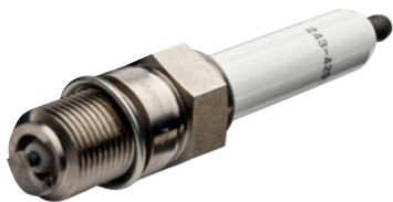
Bio-Gas Spark Plug