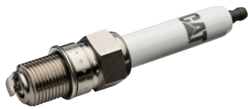
3500/3600 Spark Plug